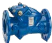
Series 41/60 Swing check valve with free shaft end Resilient seated Ductile iron DN50-300