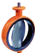
Series 75/11 Centric butterfly valve with fixed NBR liner Ductile iron With any type of actuation