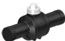
Series 85/30 Ball valve with spigot ends PE100 DN25/Ø20 mm - DN150/Ø180 mm