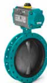
Desponia® - U-section Centric butterfly valve with loose NH liner or FPM VD liner U-section Ductile iron DN150-1600 With any type of actuation