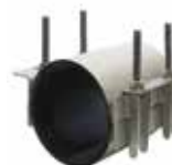
Series 748/02 Repair clamp Double band Stainless steel AISI 304 or AISI 316 NBR rubber