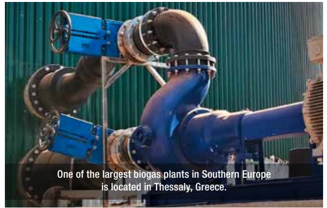
One of the largest biogas plants in Southern Europe is located in Thessaly, Greece.