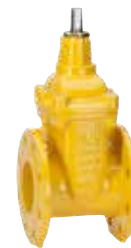
Series 06/70 Flanged gate valve Short face to face DIN F4 NBR wedge Ductile iron DN40-600