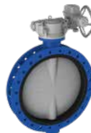
Series 820/20 Centric butterfly valve with loose NBR liner U-section Ductile iron DN150-1600 With any type of actuation