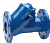
Series 53/35 Ball check valve with flanges Ductile iron DN50-600