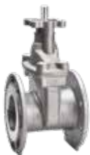
Series 06/42 Flanged gate valve with ISO top flange Short face to face DIN F4 NBR wedge Duplex stainless steel DN40-200