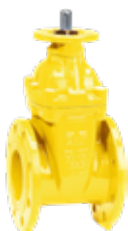
Series 15/78 Flanged gate valve with ISO top flange Short face to face DIN F4 NBR wedge Ductile iron DN50-400