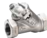
Series 53/40 Ball check valve with internal BSP threads Acid-resistant stainless steel DN32-80