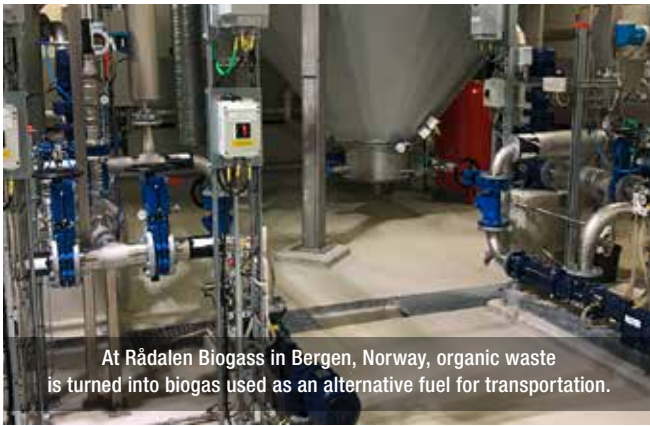
At Rådalen Biogass in Bergen, Norway, organic waste is turned into biogas used as an alternative fuel for transportation.