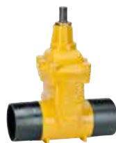
Series 46/64 Gate valve with short spigot ends Steel GP240GH DN50-300