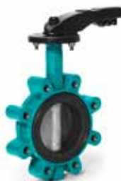
Desponia® - Lug Centric butterfly valve with loose NH liner or FPM VD liner Lug Ductile iron DN25-600 With any type of actuation