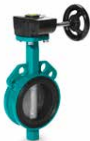
Desponia® - Wafer Centric butterfly valve with loose NH liner or FPM VD liner Wafer Ductile iron DN25-1000 With any type of actuation