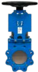
Series 702/10 Knife gate valve with non-rising stem and handwheel Ductile iron DN50-1200