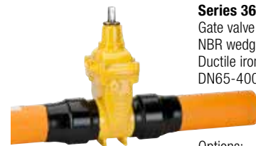
Series 36/90 Gate valve with PE ends NBR wedge Ductile iron DN65-400