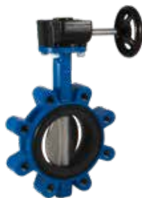
Series 820/10 Centric butterfly valve with loose NBR liner Lug Ductile iron DN25-600 With any type of actuation